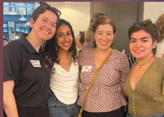
Staff members celebrate the 10th Anniversary of the Medical Legal Community Partnership in September 2023

healthcare. By resolving legal issues that contribute to poor health outcomes, the MLCP has helped to improve the quality of life for countless Philadelphians, reducing stress and removing barriers to accessing essential services.